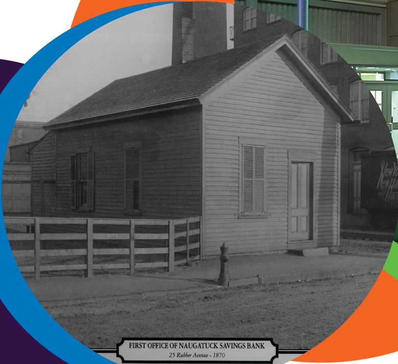
FIRST OFFICE OF NAUGATUCK SAVINGS BANK 25 Rubber Avenue - 1870